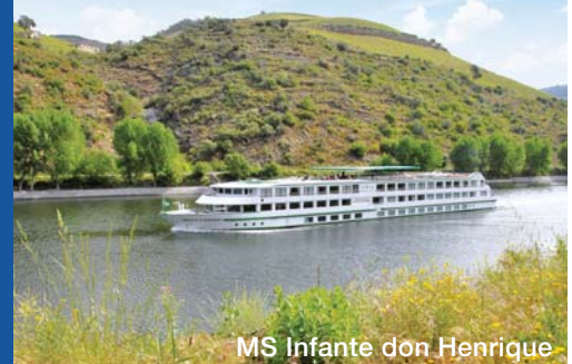
MS Infante don Henrique

Any air holidays and flights in this brochure are ATOL protected by the Civil Aviation Authority. Tailored Travel's ATOL number is 5605