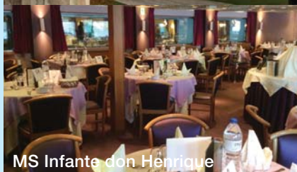
MS Infante don Henrique